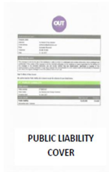
PUBLIC LIABILITY COVER