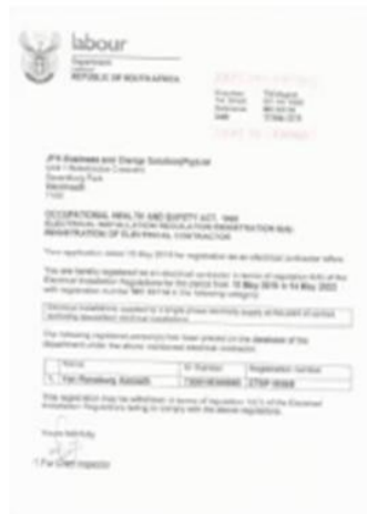
REGISTERED ELECTRICAL CONTRACTOR