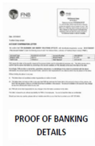
PROOF OF BANKING DETAILS