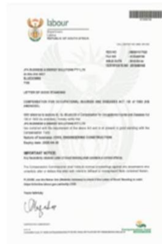
LETTER OF GOOD STANDING - COID