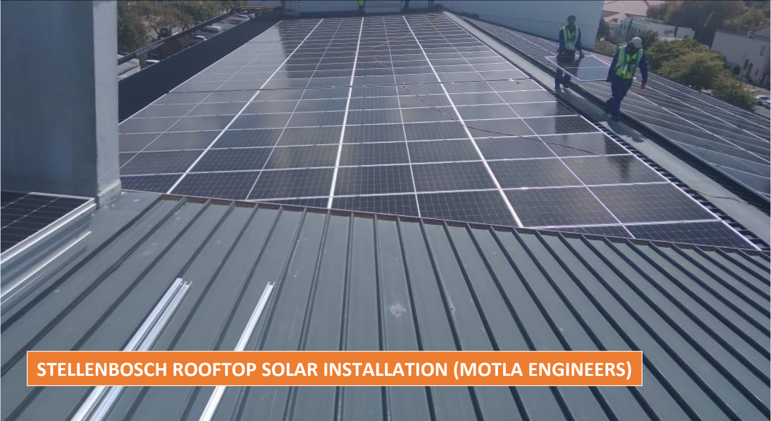
STELLENBOSCH ROOFTOP SOLAR INSTALLATION (MOTLA ENGINEERS)