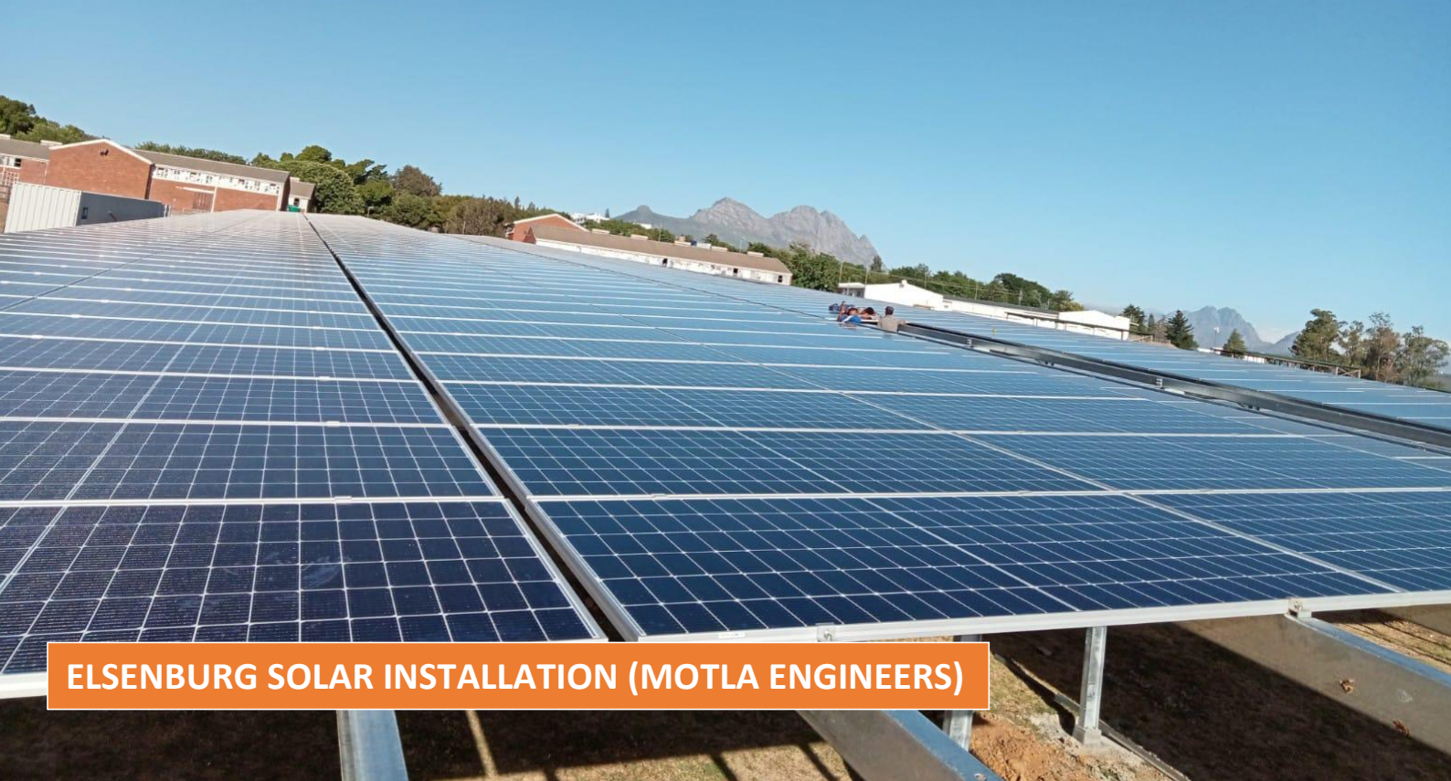
ELSENBURG SOLAR INSTALLATION (MOTLA ENGINEERS)