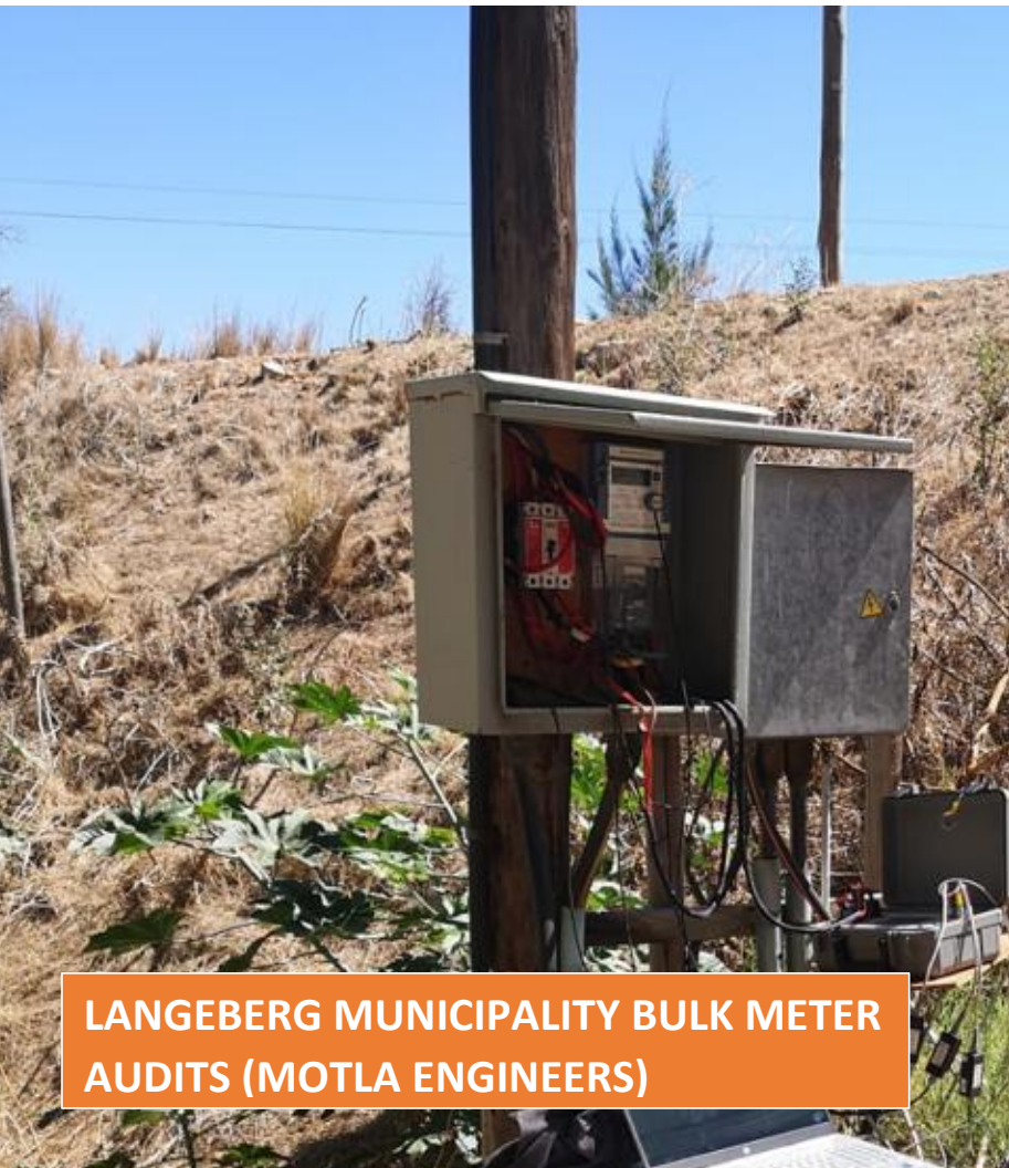
LANGEBERG MUNICIPALITY BULK METER AUDITS (MOTLA ENGINEERS)