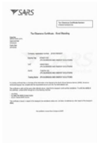
TAX CLEARANCE CERTIFICATE