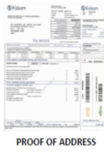
PROOF OF ADDRESS