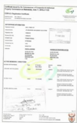
CIPC COMPANY REGISTRATION