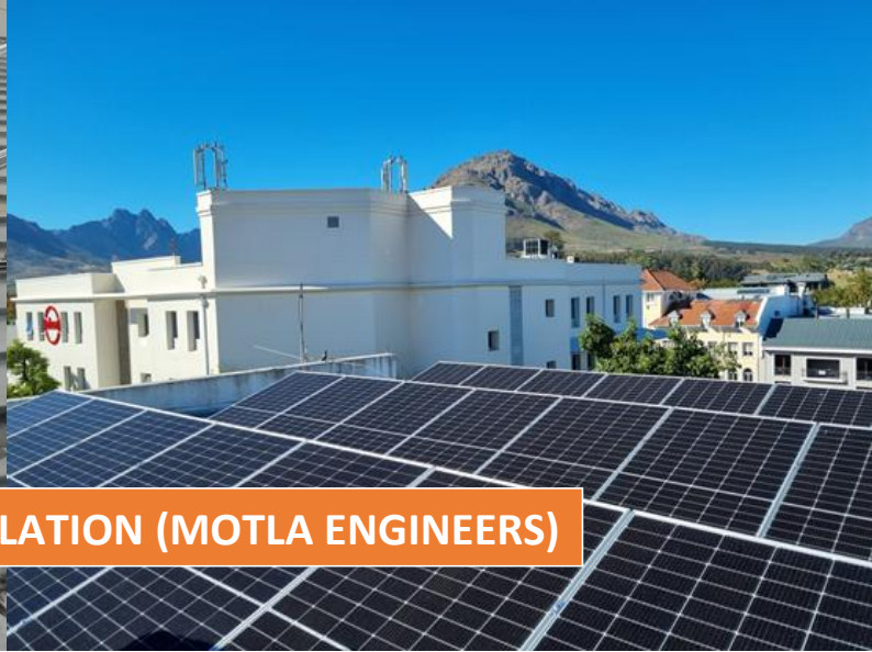
STELLENBOSCH ROOFTOP SOLAR INSTALLATION (MOTLA ENGINEERS)